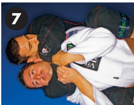
7 And sink in the rear naked choke.