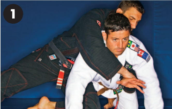
1 Set up Yoga Hook position.